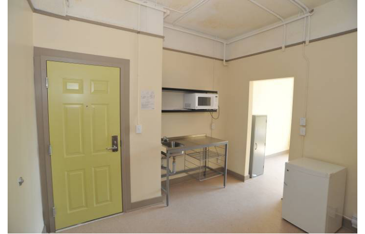
Above: kitchen area pre-renovation at the Park and another kitchen area post-renovations.