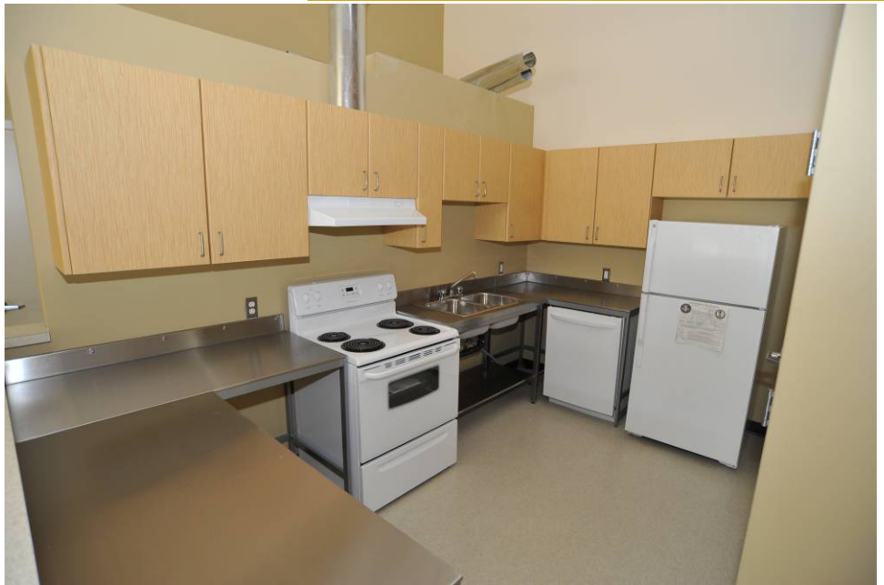
Above: A kitchen in Orange Hall pre-renovations (left) and a common area kitchen post-renovations.