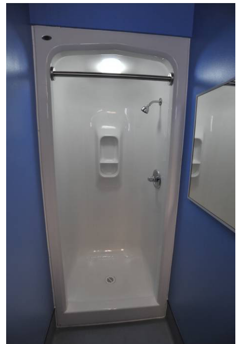
Above: putting the finishing touches on the exterior of the Savoy Hotel (left) and the building's renovated common washrooms.