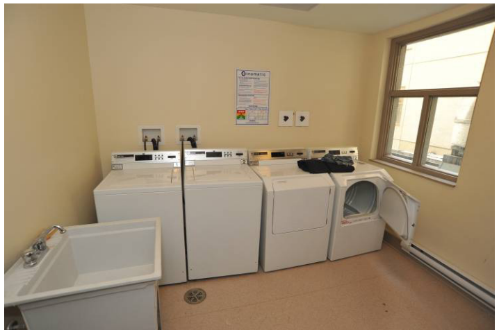
Above: a newly renovated unit at the Park Hotel before tenancy (left) and the building's common laundry facilities.