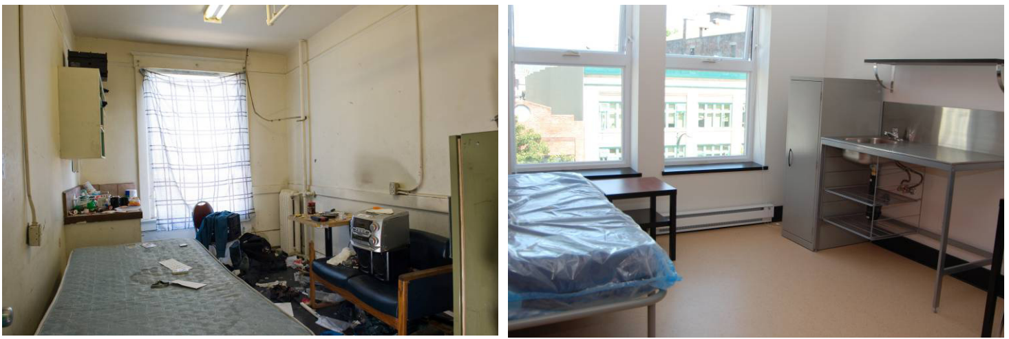
Above: rooms at the Savoy pre-renovations (left) and post-renovations (right).